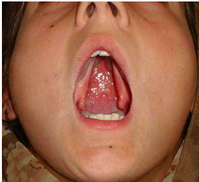
(Patient with complete cleft palate)

When most of these faults are present that person is said to have cleft palate speech. This term is not a good one, for, as will be shown later, this type of speech may occur in a person who has no cleft palate and who indeed may have a normal palate. In using this term one may be manoeuvred into the foolish position of having to say that a patient has "cleft palate speech without cleft palate ". (Davenport & Hannahs, 2005).