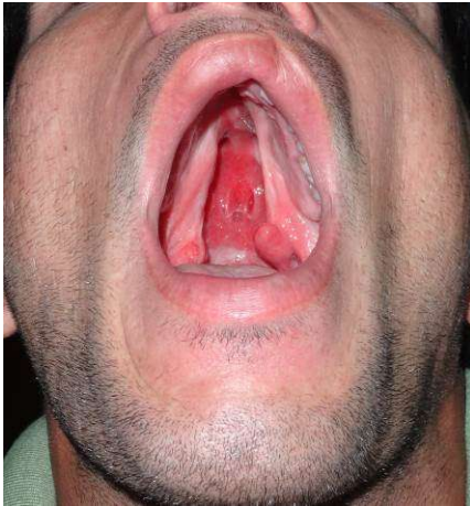
(Patient with complete cleft palate)

escape may be present from the beginning, so that the development of normal speech is prevented. In such cases severe disturbances of articulation are commonly found. Nasal escape may also occur after the development of normal speech. If the onset is gradual the effect on articulation is minimal: there may be some lack of clarity and poor voice projection and tone, but little disturbance of the vowels and consonants. Such an event may occur in the normal and in cleft palate patients in adolescence. When, however, the onset of nasal escape has been sudden, such as may occur after the surgical removal of adenoid tissue, more severe disturbances in speech associated with considerable emotional upsets are encountered. (Davenport & Hannahs, 2005).